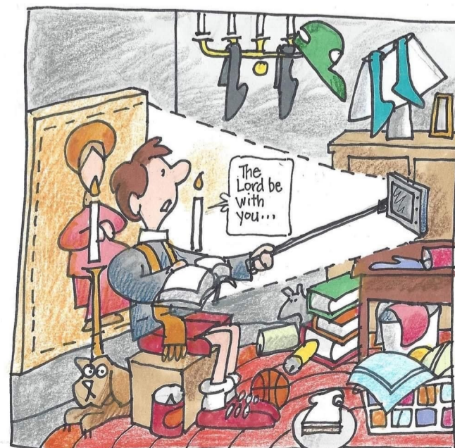
THE PRIEST CARVES OUT SACRED SPACE AT HOME IN ORDER TO RECORD LITURGY FOR SUNDAY.